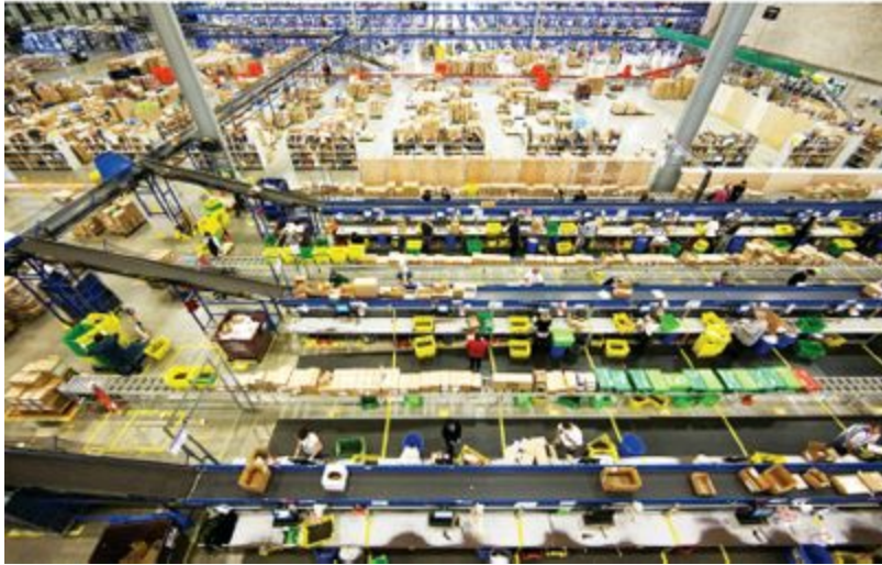
An Amazon fulfillment center in Milton Keynes, forty-five miles northwest of London.