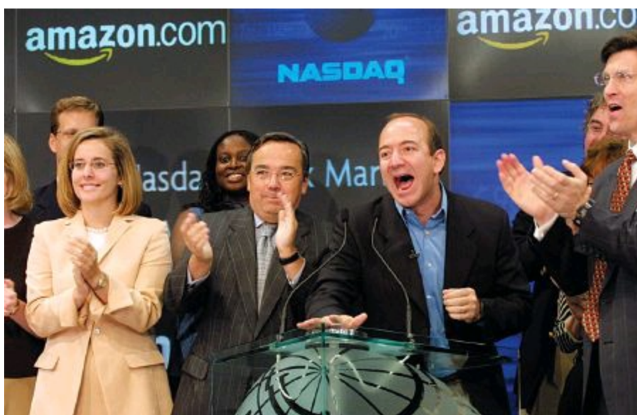
Jeff Bezos rings the bell to open the NASDAQ trading session on Friday, September 7, 2001.