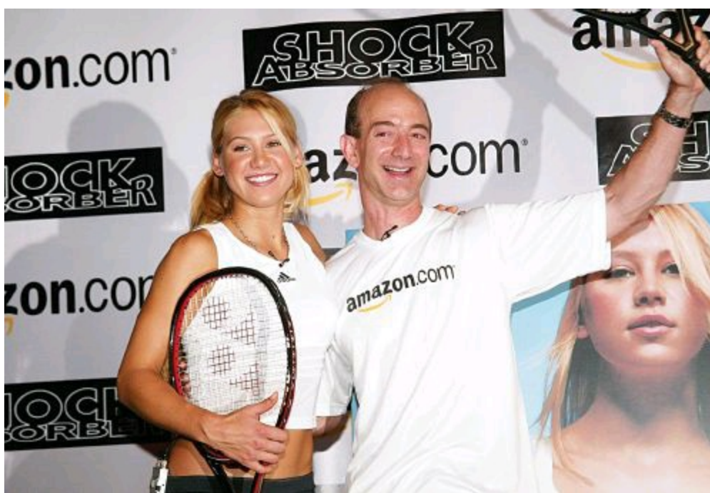
Bezos and tennis pro Anna Kournikova after an exhibition round of tennis at New York's Grand Central Terminal to promote Amazon's new apparel store, August 22, 2003.