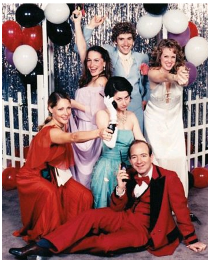
Jeff and MacKenzie Bezos (center) celebrate with Amazon employees at a company costume party.