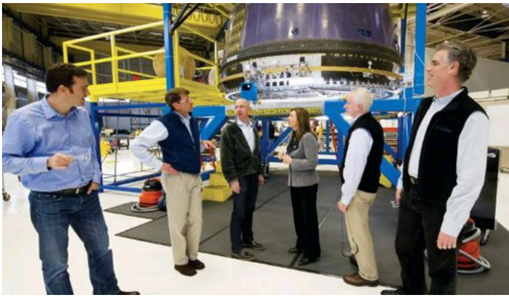
NASA deputy administrator Lori Garver (third from right) takes a tour of the Kent, Washington, headquarters of Blue Origin, Bezos's private space-exploration company.