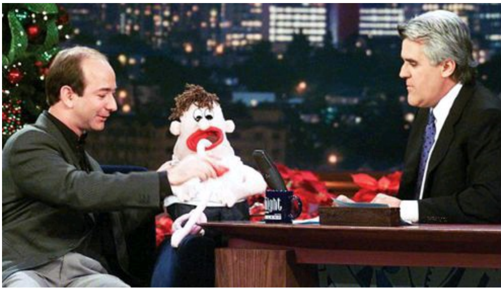
Jeff Bezos demonstrates an educational toy called Gus Gutz to talk-show host Jay Leno during his appearance on The Tonight Show with Jay Leno at the NBC studios in Burbank on December 29, 1999.