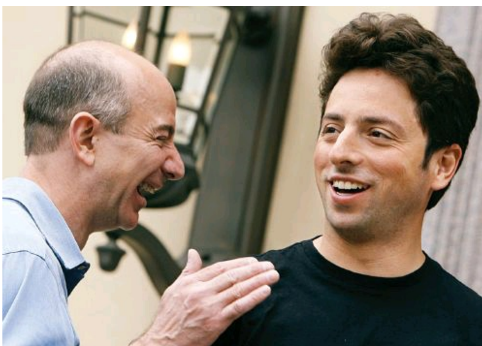
Jeff Bezos laughs with Google cofounder Sergey Brin at the Allen and Co. conference in Sun Valley, Idaho, in 2007. Bezos was among the original investors in Google.