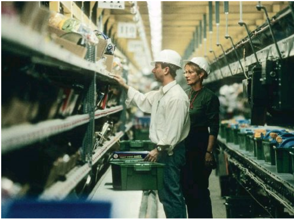
Bezos helps process toy orders at the short-lived fulfillment center in McDonough, Georgia.