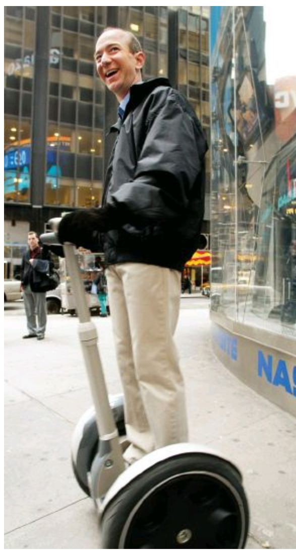
Bezos stands on a Segway in 2002 as the ill-fated electric-powered transporter goes on sale exclusively at Amazon for $5,000.