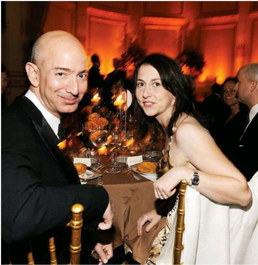
Jeff and MacKenzie Bezos in 2009.