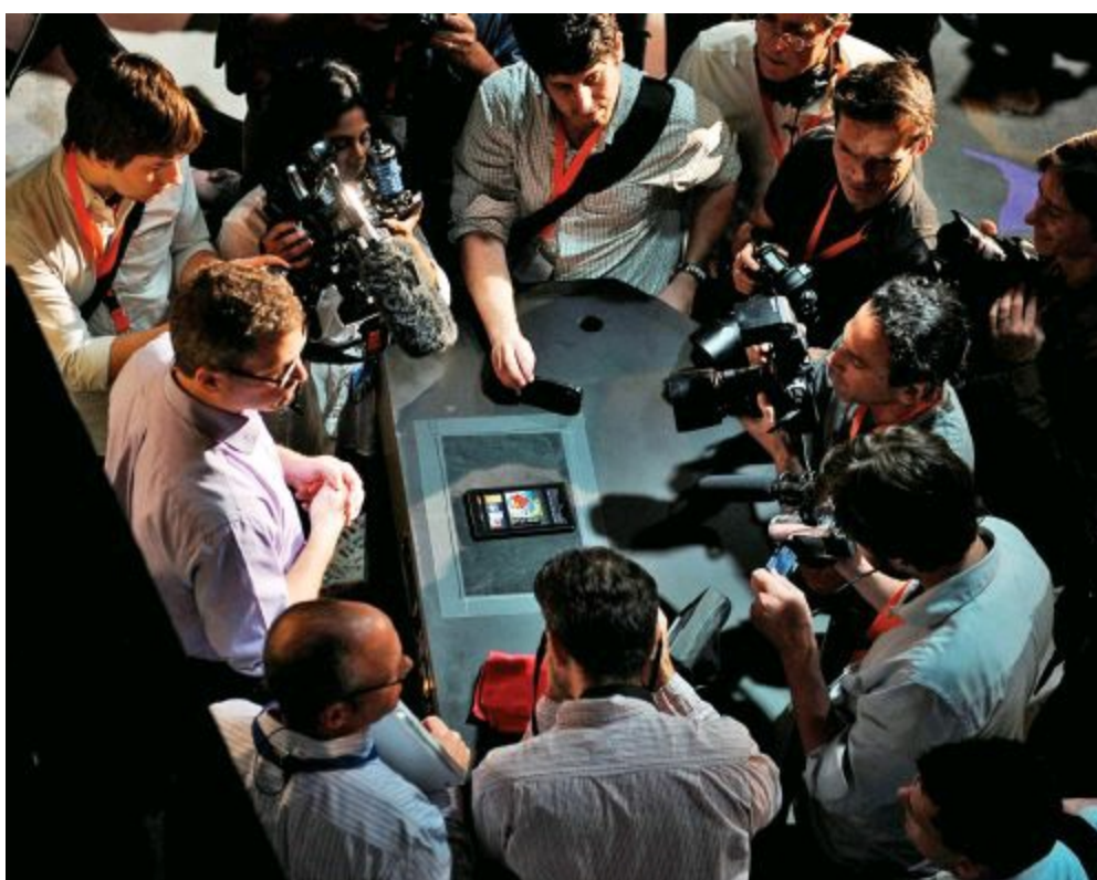
An Amazon employee demonstrates the Kindle Fire to reporters after a news conference.