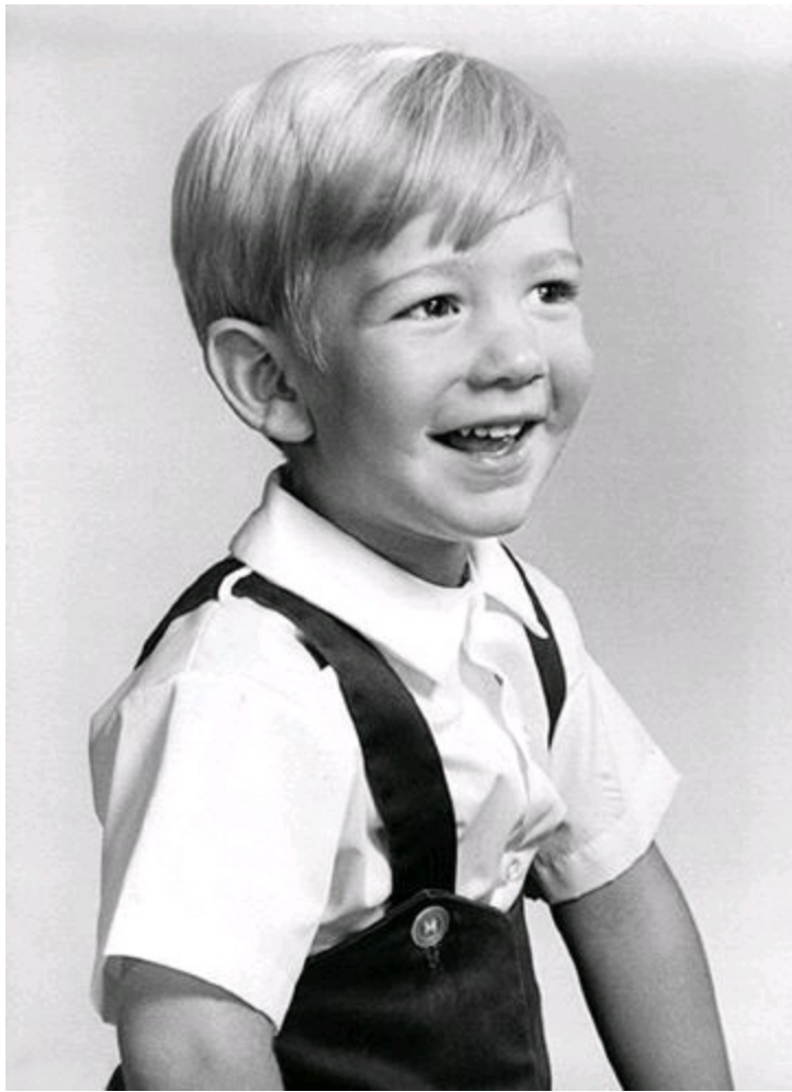
Jeff Bezos, childhood portrait.