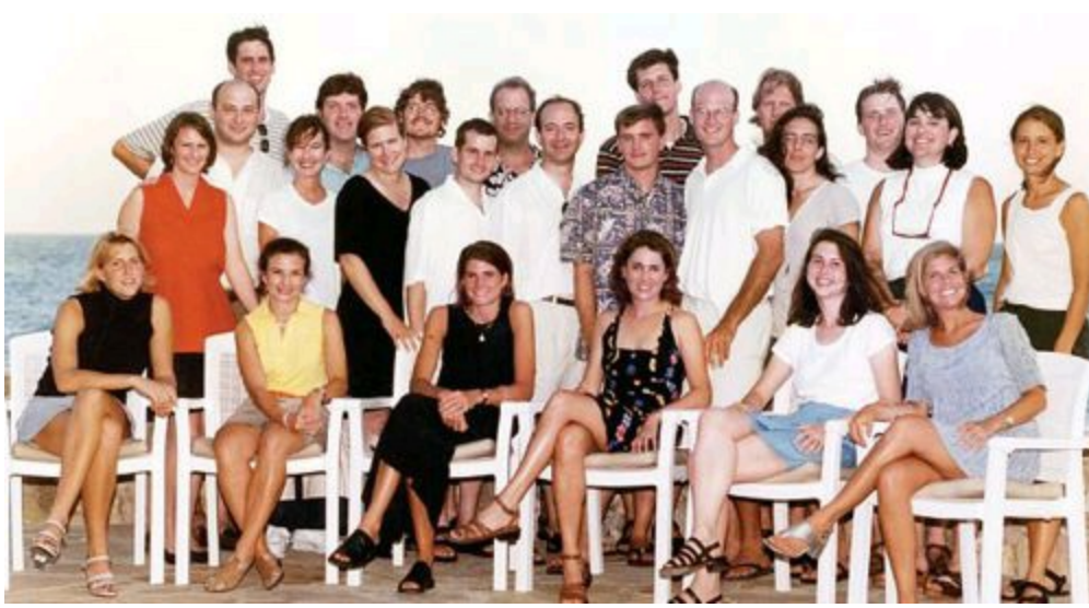
Amazon and Deutsche Bank employees who worked on Amazon's 1997 IPO celebrate with family members in Cabo, Mexico.