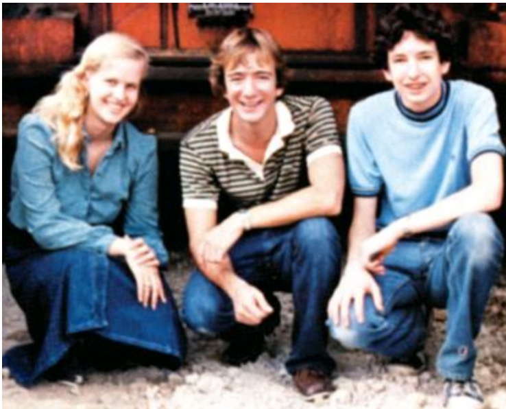
Bezos in 1982, as a senior at Miami Palmetto High School.